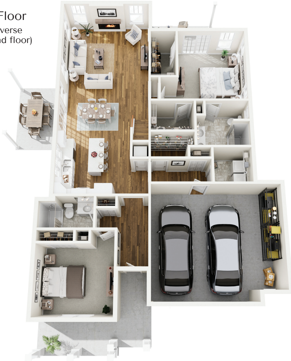
First Floor (see reverse for second floor)

Ask to see alternate layout with den upgrade, and alternate main bedroom and kitchen layouts.